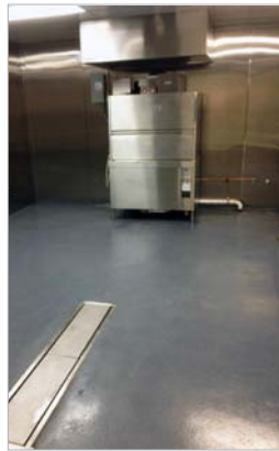
CSI Division 9: Finishes - Flooring